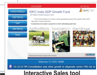
Interactive Sales tool