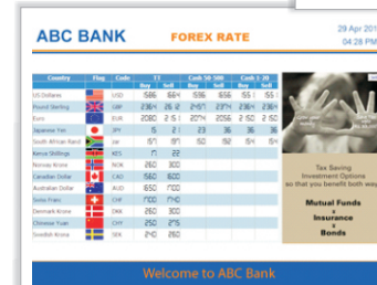
Displaying Forex Rate