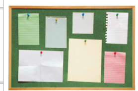
Mandatory Notices & KYC