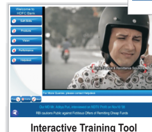
Interactive Training Tool