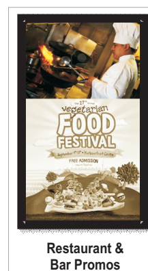
Restaurant & Bar Promos