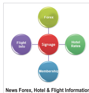
News Forex, Hotel & Flight Information