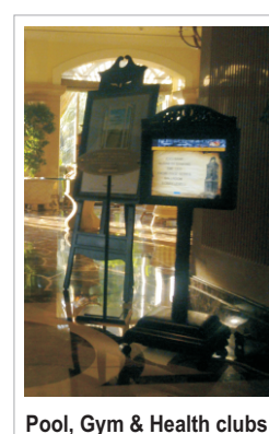
Pool, Gym & Health clubs